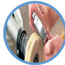
Buffing / Polishing