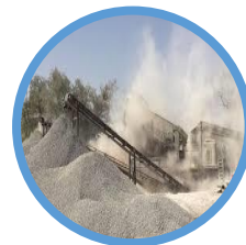
Mining & Silica Dust

NAPCEN Provide Complete Solutions for Dust Control, Fumes Control, Oil Mist Control and Smoke/Gas Control